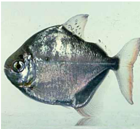
silver dollar fish

Residents were very concerned when three fish died. Rog spent several days replacing and testing the water to ensure the chemical balance was safe for the other fish. All can let out a sigh a relief and now have three new fish.